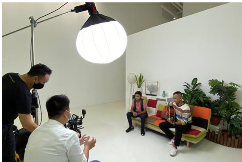
(Behind the scenes at ChildAid 2020: Virtually Yours.)