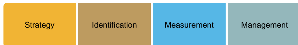
Exhibit 2: The SIMM Pillars

The key principles of the Framework are anchored in four pillars: Strategy, Identification, Measurement, and Management (“SIMM”). It is important to address all four pillars, although the order in which they are addressed is secondary.