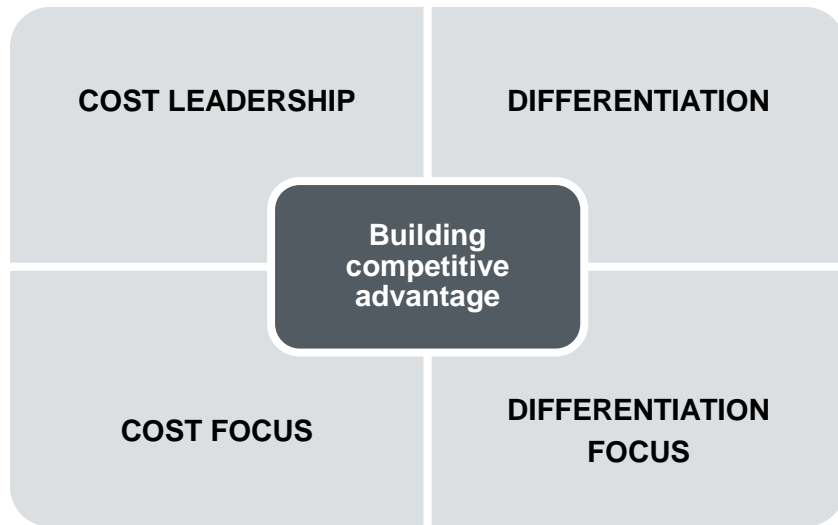
Exhibit 4: Porter's Competitive Strategy Framework 8