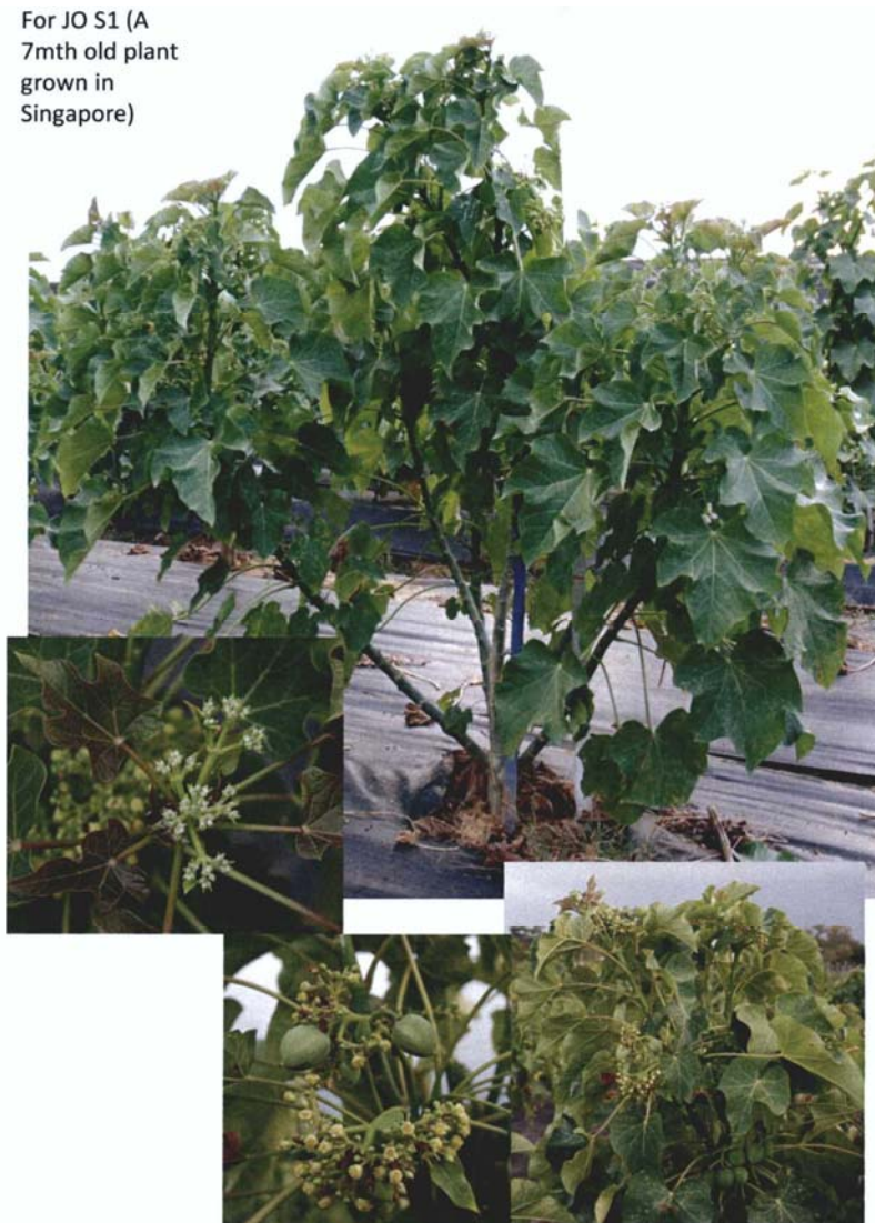
For JO S1 (A 7mth old plant grown in Singapore)